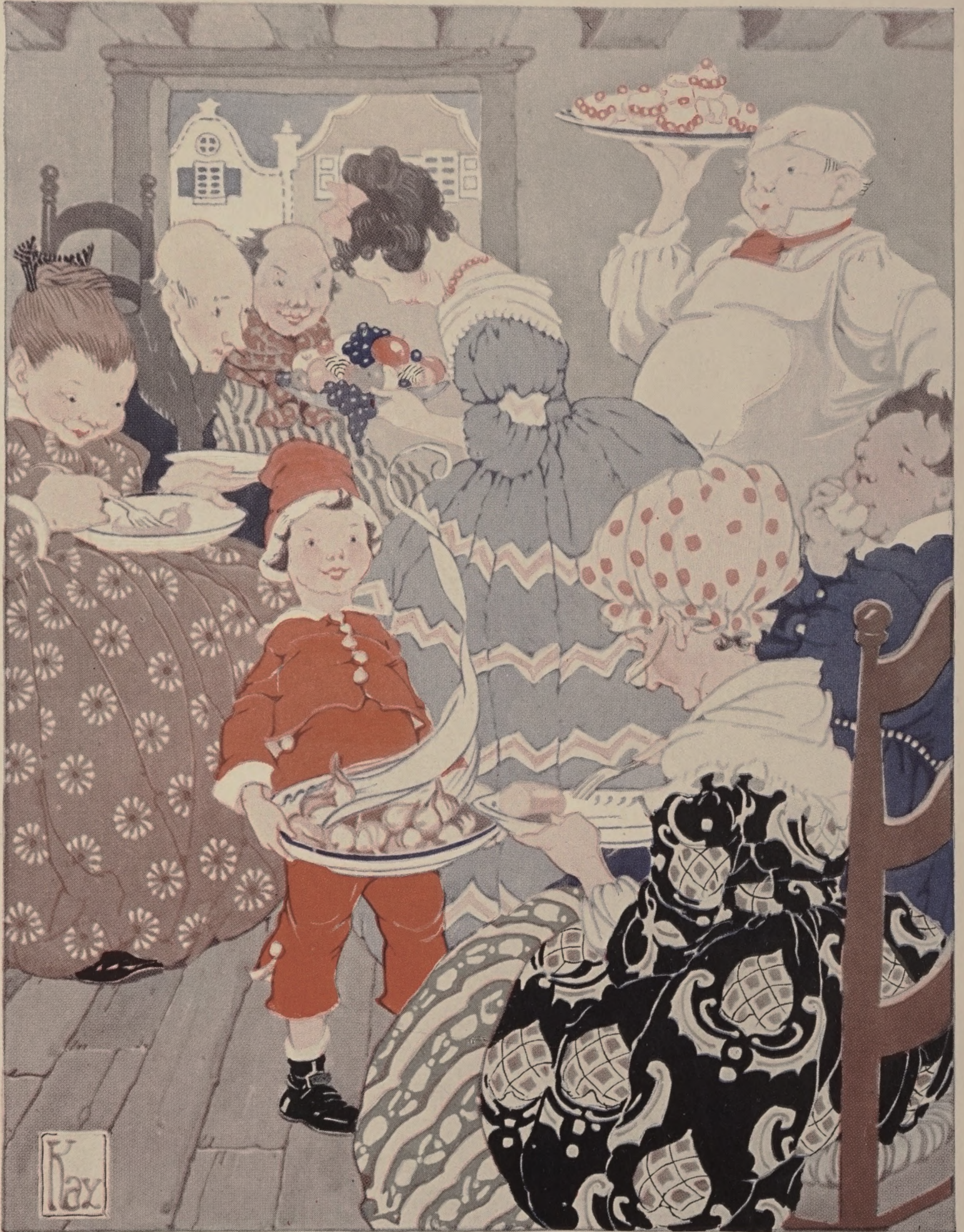
They sat in a circle, while Mrs. Claus and Mr. Claus and Santa hurried to pass around food